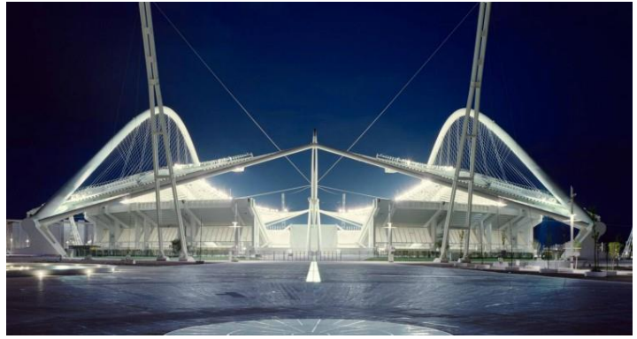
Olympic Stadium in Maroussi

Athens is the historical capital of Europe, with a long history, dating from the first settlement in the Neolithic age. In the 5th Century BC (the "Golden Age of Pericles") – the culmination of Athens' long, fascinating history, the city's values and civilization acquired a universal significance. Over the years, a multitude of conquerors occupied Athens, and erected unique, splendid monuments - a rare historical palimpsest. In 1834 it became the capital of the Modern Greek State and in two centuries became an attractive modern metropolis with unrivalled charm.