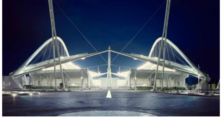
Olympic Stadium in Maroussi

Athens is the historical capital of Europe, with a long history, dating from the first settlement in the Neolithic age. In the 5th Century BC (the “Golden Age of Pericles”) – the culmination of Athens’ long, fascinating history, the city’s values and civilization acquired a universal significance. Over the years, a multitude of conquerors occupied Athens, and erected unique, splendid monuments - a rare historical palimpsest. In 1834 it became the capital of the Modern Greek State and in two centuries became an attractive modern metropolis with unrivalled charm.